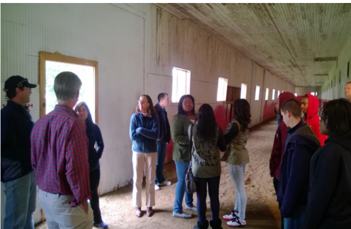
The group stands on a unique feature of Sagamore Farm: a quarter-mile long indoor training track.