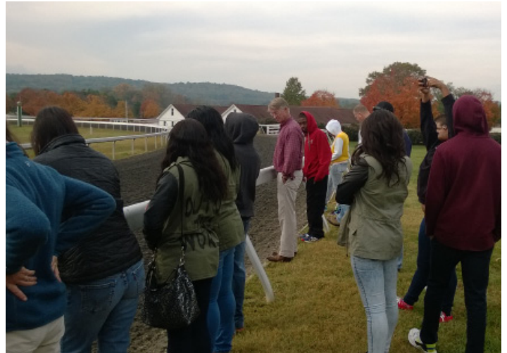
The group is shown a unique synthetic training surface which includes pieces of recycled Under Armour shirts.