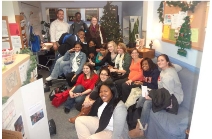
Bridges students and Loyola tutors pose for a group shot after their final meeting of the fall semester.