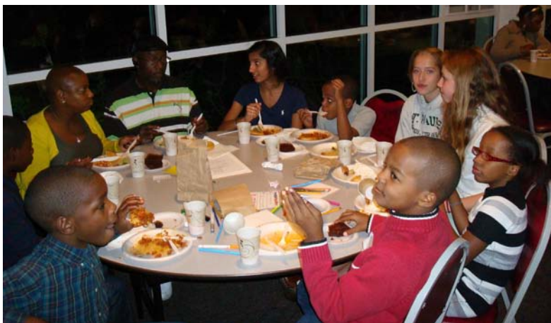
Volunteers in the Bridges Winter Tutoring Program enjoy dinner with the families of their fourth and fifth grade students.

One hundred eighty five Bridges parents, students, teachers, and volunteers kicked off the holiday season with the Sixth Annual Bridges Holiday Dinner on Monday, November 22. The evening started with a wonderful performance by the St. Paul's School Jazz Band and was followed by dinner, an appreciation event, a carnival hosted by students from the St. Paul's Schools, and a series of performances in the Ward Center Theatre.