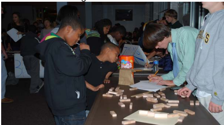
Prior to dinner, students engage in a small carnival facilitated by high school volunteers from Bridges' winter and summer programs. The Tower Building Challenge, pictured, is a student favorite.